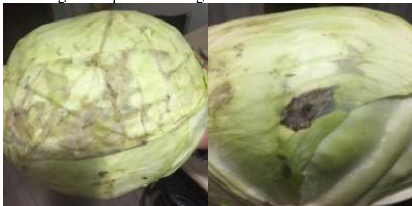
Figure 4. Symptoms of Hyaloperonospora brassicae in the field on cauliflower heads

Similar symptoms appear in the field and lead to early death of the leaves; in moist weather the spots grow larger, join together and form large dead patches in Fig. 4.