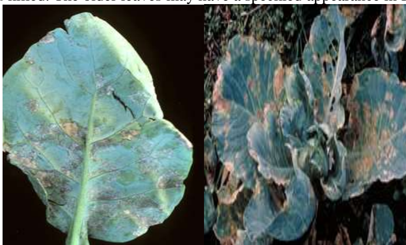
Figure 3. Symptoms Hyaloperonospora brassicae in theseedbeds

A grayish white growth occurs on the underside of the leaves, and may be present, too, on the upper surface during cool and moist conditions. The infected areas turn brown and papery in dry weather. Severely affected seedlings are stunted and killed. The older leaves may have a speckled appearance in Fig. 3.