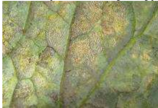
Figure .1. Symptoms of consortium on cabbage leaves

Observations have shown that the formation of the consortium begins when air and soil temperatures are 24 to - 30°C, and an optimum temperature is about 27°C. High humidity (90-95%) hastens the formation of the consortium. At present, the studies are being continued to detect the initiator fungus taking part in the formation of a consortium and to determine the relationship between the fungi taking part in it.