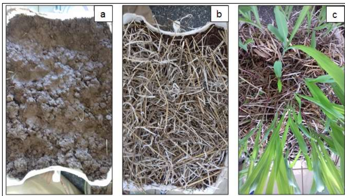
Figure 1 - Top view of models with different treatments: a) only discovered soil; B) only covered with canola straw; C) soil covered by canola straw and corn plants.

In each of the holes made for the collection of water, transparent polyethylene tubes were attached to drainage of the water drained surface and water infiltrated in each of the models. The water was collected in plastic buckets for later gauging in graduated test tubes.