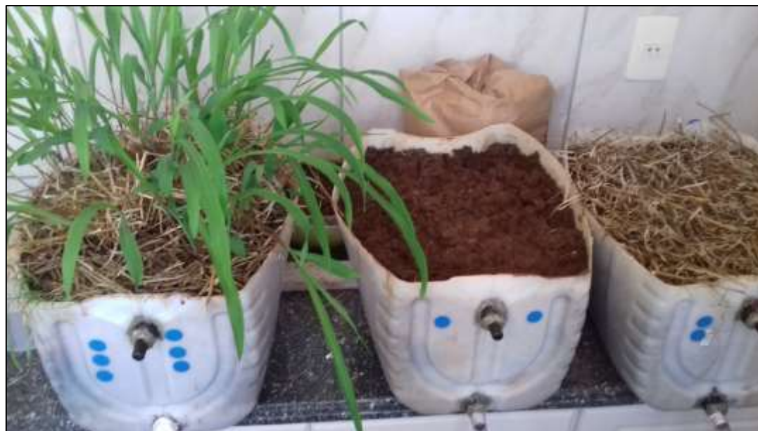
Figure 2 - Front view of the soil models, showing upper and lower holes for collecting the drained and infiltrated water, respectively.